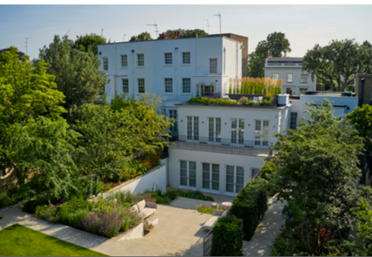
Gold Award McWilliam Studio West London Garden Residential Design