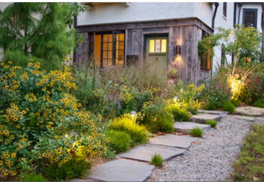
Gold Award Refugia Design Narberth Living Landscape Specialty Projects