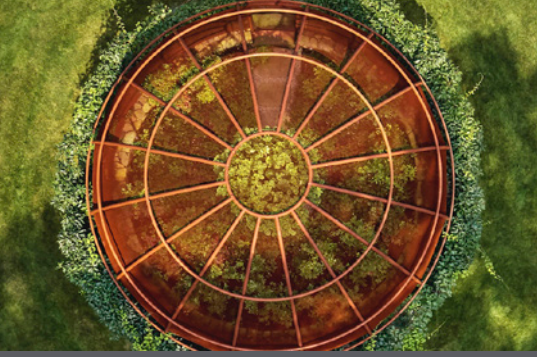
Gold Award Haver & Skolnick Architects The Berry Bowl Specialty Projects