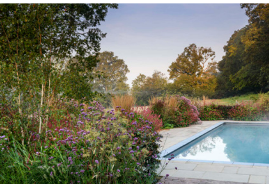
Gold Award Jo Thompson Landscape & Garden Design Low Poles UK Planting Design