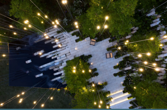
2022 Best of Show – Gold Award McWilliam Studio Between Heaven and Earth Show Gardens