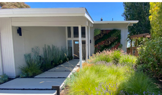
Gold Award Eileen Kelly, Dig Your Garden Landscape Design Modern Revamp With Living Wall Residential Design