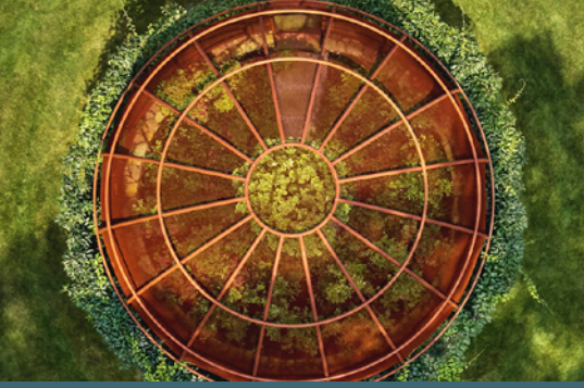
Gold Award Haver & Skolnick Architects The Berry Bowl Specialty Projects