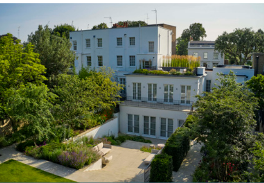
Gold Award McWilliam Studio West London Garden Residential Design