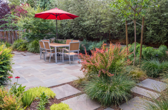
Gold Award Blue Hibiscus Gardens New Life After Construction Small Gardens