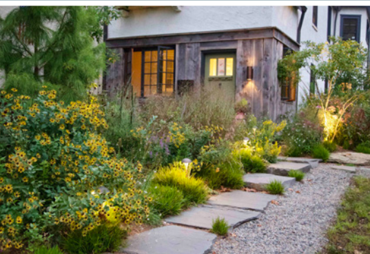
Gold Award Refugia Design Narberth Living Landscape Specialty Projects