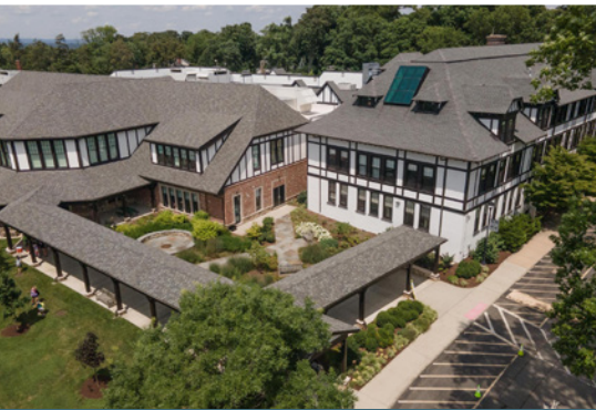
Gold Award M.ERBS Fine gardens Private School Entry Non-Residential Design

Each entry category is evaluated independently. The type, size and cost of the project will not be criteria for judging. The judging criteria totals 100 points. Projects scoring 90 points or above will receive Gold awards. Projects scoring between 80 to 89 points will receive Silver awards. Bronze awards are given at the judges discretion for projects scoring between 75 and 79 points.