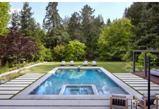
Gold Award David Thorne Landscape Architect Contemporary Retreat Residential Design