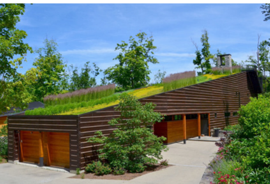
Gold Award Stride Studios Walnut Woods Green Roof Specialty Projects